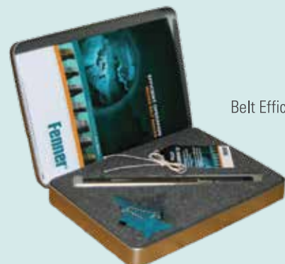
Belt Efficiency Kit

Get the most from your wedge belt drives with the Fenner Belt Efficiency Kit. It contains all the tools necessary to help achieve optimum performance: belt tension indicator, pulley groove guide and a simple guide to efficient wedge belt efficiency.