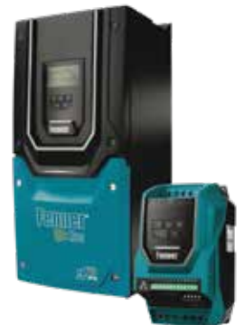
Fenner QD - Neo