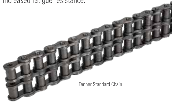
Fenner Standard Chain

Easy to fit and replace, robust and long lasting chain and increased fatigue resistance.