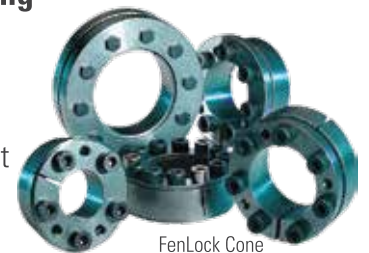
FenLock Cone Clamping

Provides a wide range of keyless shaft / hub fixing assemblies offering simple installation, increased shaft strength and high torque transmission capacity.