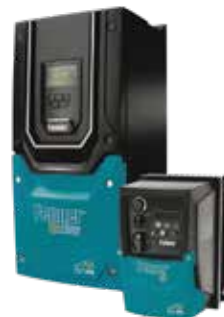
Fenner QD - HVAC

Fenner QD (Quick Drive) Series inverters are ideal for both simple and sophisticated applications, due to their broad range of functions, easy configuration, simple installation and operation.