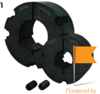
Taper Lock® Bush

Machined to exacting tolerances in cast iron and steel, available in a full range of both metric and imperial sizes as well as a full range of weld-on hubs, bolt-on hubs and hub adaptors.