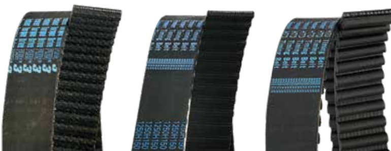
*Torque Drive PLUS 3

Offering high power transmission combined with accurate positioning in a compact drive envelope.