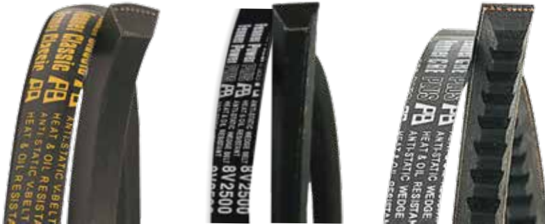
Classic V belt

Have set the standard for over 150 years. Its state-of-the-art design and manufacture reflected in optimised power ratings for compact size, economy efficiency and extended life. Superior anti-static, heat and oil resistant properties.