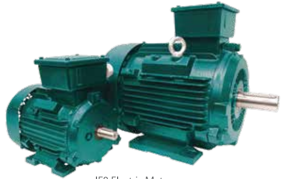
IE3 Electric Motor

Delivers energy efficient, robust solution and a lower total cost of ownership. Conform to the latest European electric motor efficiency standards and meet the efficiency performance requirements for IE3 Premium Efficiency. 160 to 315 frame all with multi mount design. All motors fitted with thermistors terminated in the terminal box